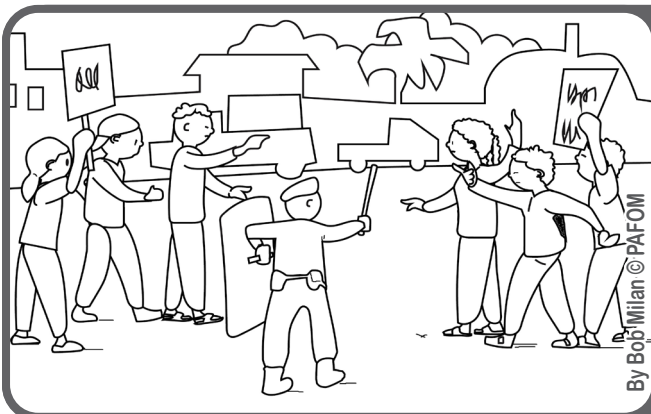
In our country, people are getting ready for the elections and so they often argue and fight with each other about the candidates.