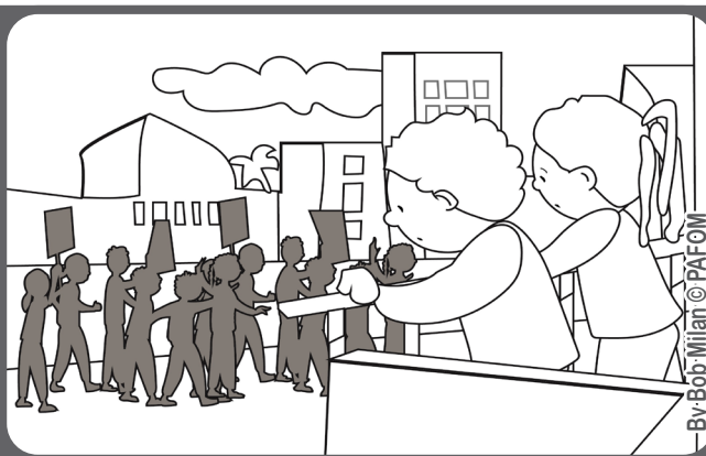
We Gen 4 decided to pray together for a peaceful election and so we met together at 6 pm every day for a whole week to pray in unity.