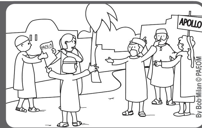
Even though all people are children of God and therefore brothers and sisters, there have always been divisions among us. We have to trust God and keep asking him constantly for the gift of unity.