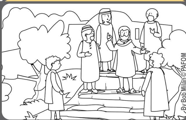
They were going downhill following large stone steps. Jesus was praying and asking his Father for the gift of unity for his disciples and for all of us (see Jn 17:21).